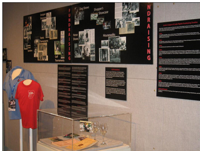
JLCR 75th Anniversary Display. Part of the display at the Carl and Mary Koehler History Center exhibit shows a history of JLCR fundraisers.